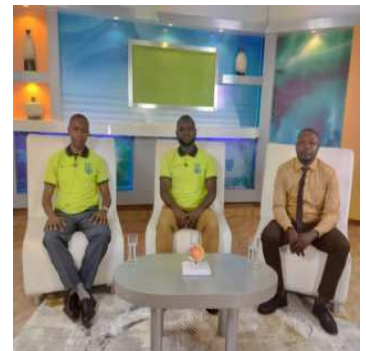
Obulamu Talk show on UBC